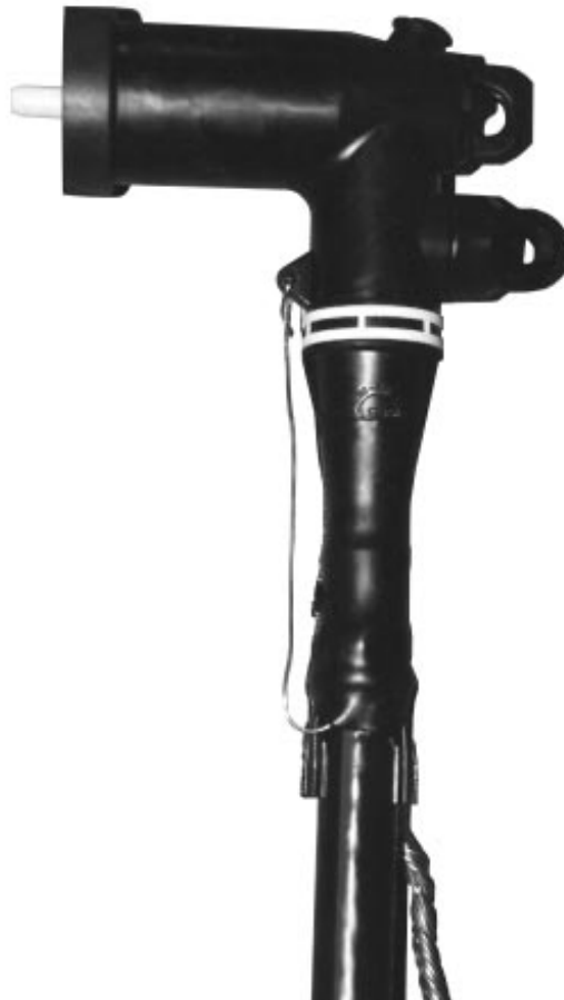
Figure 1. Cable Jacket Seal installed on cable with 15 kV loadbreak elbow.

No special tools, heat source or hand taping skills are required to install the Cable Jacket Seal. The cable is prepared according to the instructions provided with the elbow termination. Concentric neutral strands are bound down and twisted to form