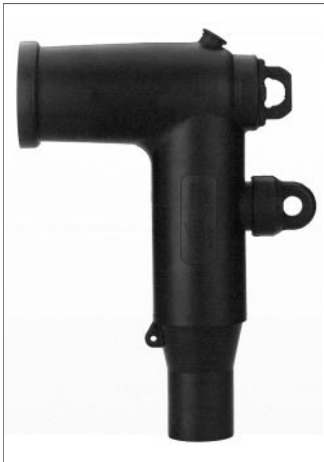
Figure 1. 400 A Deadbreak Elbow Connector.