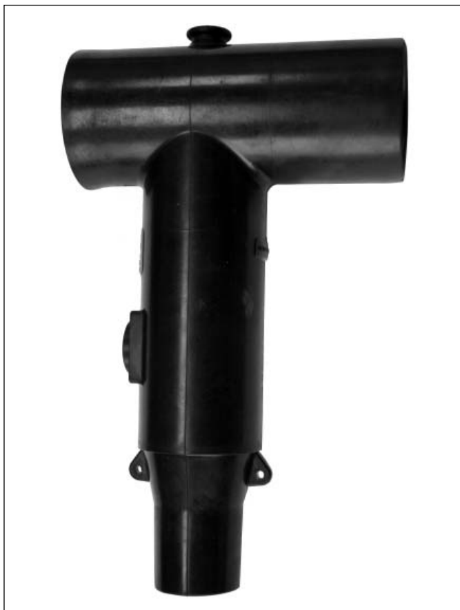
Figure 1. 630 A Deadbreak Bolted Tee Connector.